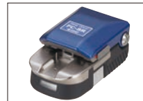
Handy cleaver FC-8R series

*Splicer operation after shock, impact, water or dust tests, was confirmed under battery power, by Sumitomo Electric. Does not guarantee the product will not be damaged by these conditions.