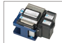
Table-top cleaver FC-6 / FC-6R series