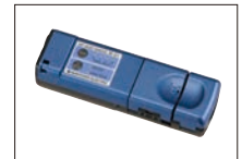
Hot jacket remover JR-6+