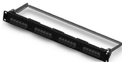
LS-MCM-MCC6 + Empty Panel