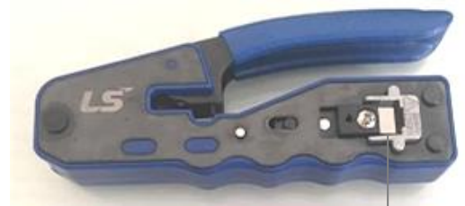
Wire Cutting & Crimping at once